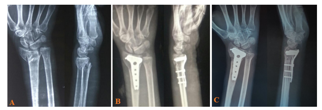
Fig-4: 45 year Old male patient- (A) Pre-operative x-rays, (B) Post-operative x-rays and (C) Follow up x-rays

patient with history of RTA, sustained juxtaarticular, unstable fracture of lower end of radius managed with external fixator on left side (Figure 5).