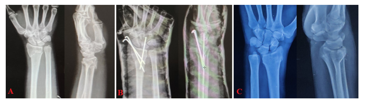
Fig-3: 43 year Old female patient- (A) Pre-operative x-rays, (B) Post-operative x-rays and (C) Follow up x-rays

In our study, 45 year old male patient with history of RTA, sustained extra-articular fracture of lower end of radius managed with volar plating on left side (Figure 4) and 34 year old male